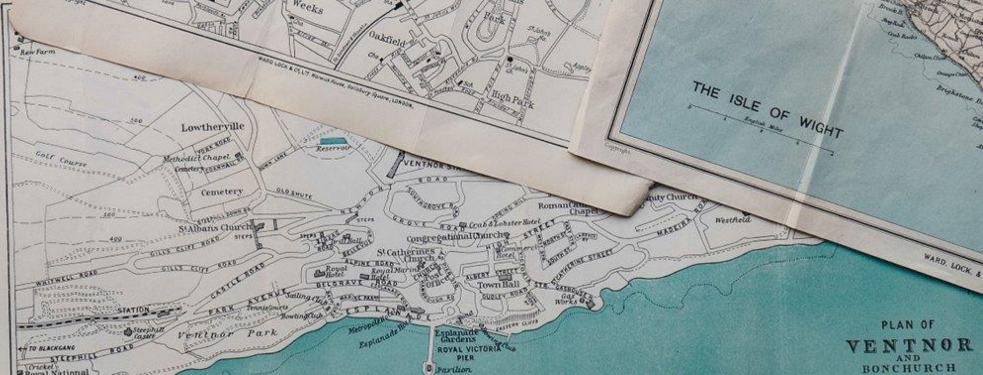
PLAN OF VENTNOR AND BONCHURCH